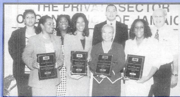
Awardees: Solid Life Ins. Brokers, Knutsford Court Hotel, Jencare Skin Farm and Palace Amusement.