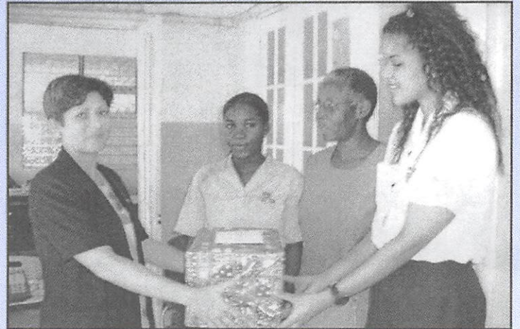
In December 2002 PSOJ staff collected funds and presented school supplies to Mount View Academy to be given to the Pringle Home for Girls in St. Mary and the Mount Olivet Boys Home in Manchester.