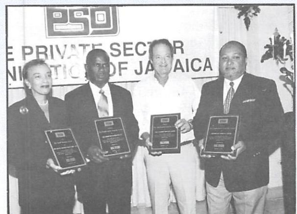
L-R: Representatives of New Lifestyle Wholesitic Health Clinic and Spa, Kingston Book Shop, Tara Courier Services, Securicor Jamaica.